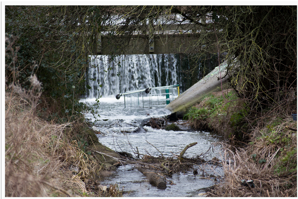
10. Morrison's special Canon EOS 6D, 55-200mm, focal length 200.0mm 1/125, f/5.6, ISO800