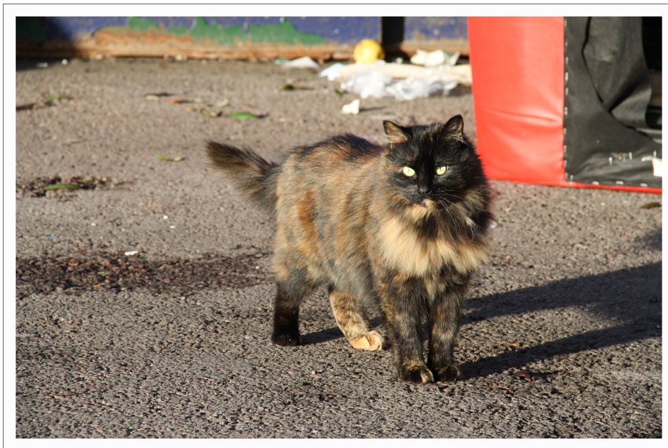
4. Feline Friend Canon EOS 1000D, EF-S18-135mm lens, focal length 126.00mm 1/200, f/8, ISO200