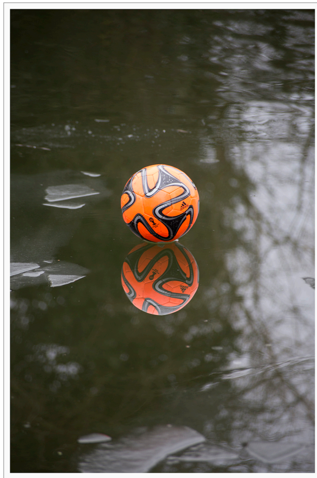
12. Freeze Frame Canon EOS 6D, EF100-300mm, focal length 200.0mm 1/125, f/5.6, ISO640

Please see my learning log in support of this project.