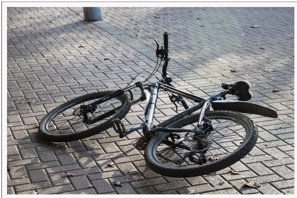
2. Pedal Power Canon EOS 1000D, EF-S18-135mm lens, focal length 135.00mm 1/60, f/5.6, ISO200