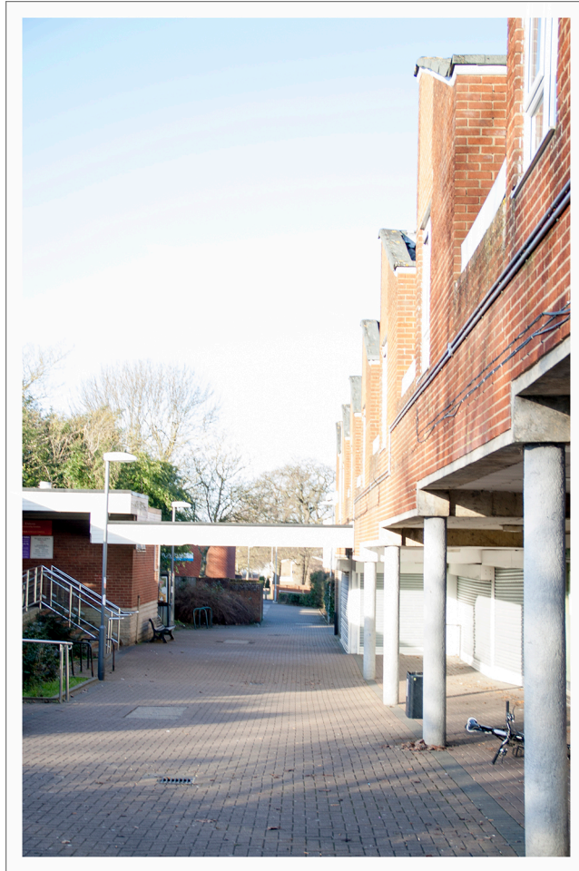
3. Not the Centre of attention Canon EOS 1000D, EF-S18-135mm lens, focal length 135.00mm 1/80, f/5.6, ISO200