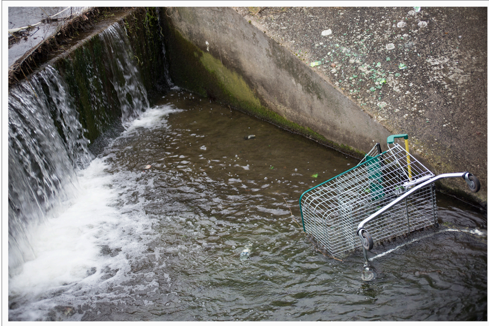
9. This trolley can't swim! Canon EOS 6D, 55-200mm, focal length 55.0mm 1/125, f/4.0, ISO400