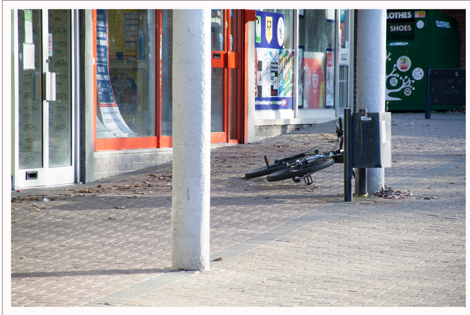
1. Pillar of the Community Canon EOS 1000D, EF-S18-135mm lens, focal length 135.00mm 1/60, f/5.6, ISO200